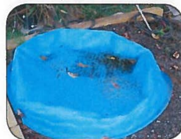
Drain water from pools when not in use.