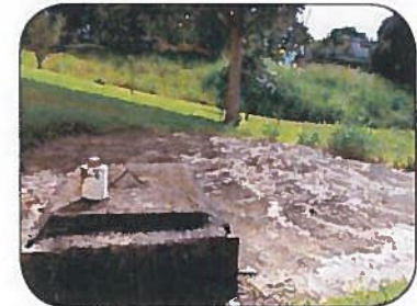
Keep septic tanks sealed.