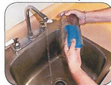
Weekly, scrub vases & containers to remove mosquito eggs.