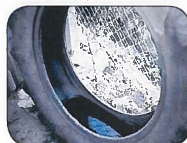
Recycle used tires or keep them protected from rain.