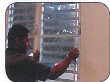
Install or repair window & door screens.

For more information, visit: www.cdc.gov/dengue , www.cdc.gov/chikungunya , www.cdc.gov/zika