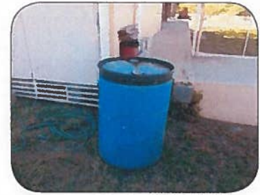
Keep rain barrels covered tightly.