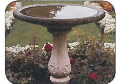
Weekly, empty standing water from fountains and bird baths.