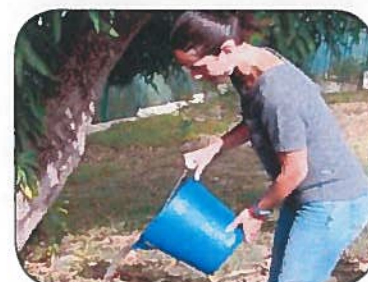
Drain & dump any standing water.